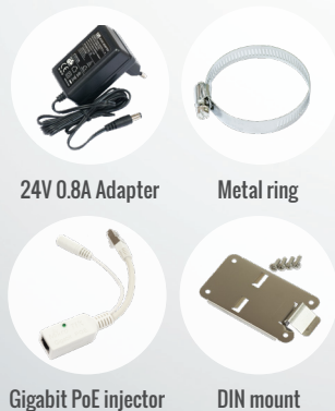
24V 0.8A Adapter